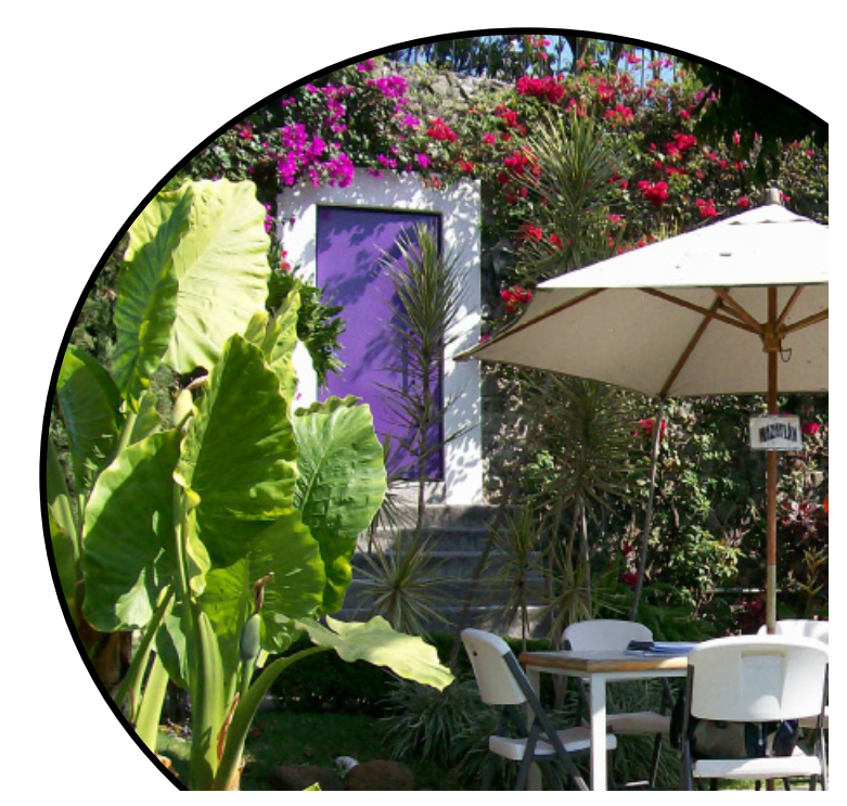
Student Teaching in Cuernavaca, Mexico