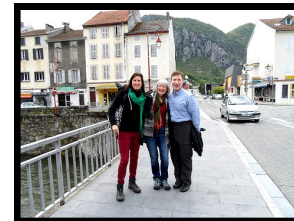
Abbaye de Lagrasse